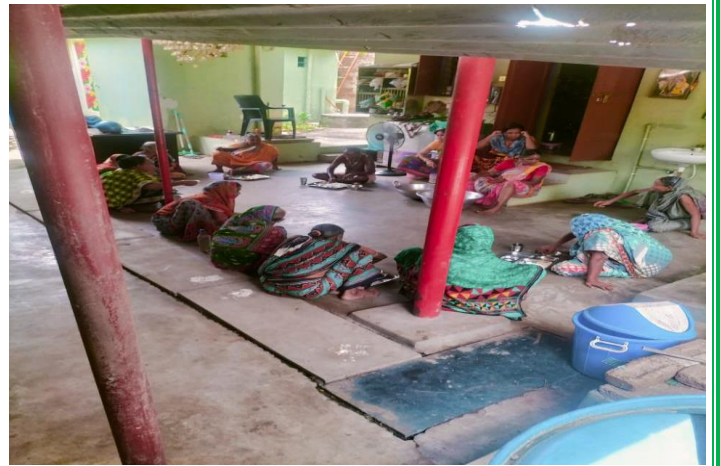
Yoga Classes & Entertainments