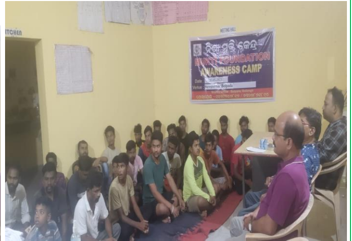
Group Counselling Session