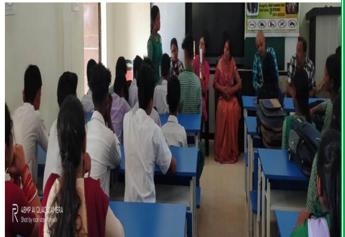
School Sensitization Programme at Balasore & Khordha District in Odisha