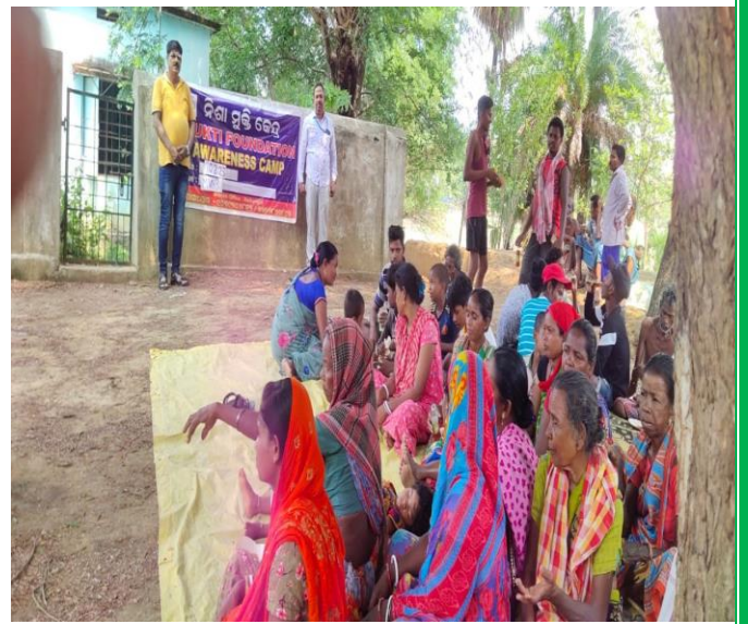
Focus Group Discussion