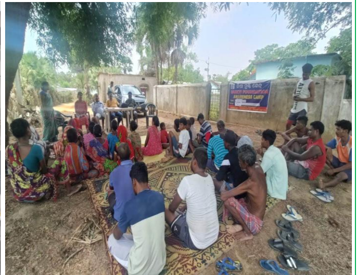
Advocacy Meeting with Stakeholder Focus Group Discussion